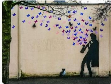
9. Street artists