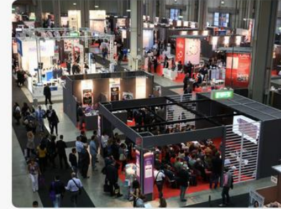
5. A city of digital and technology innovation