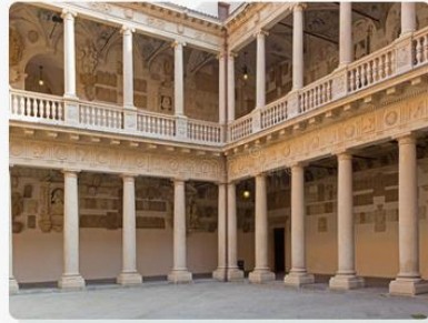
3. University of Padua: Palazzo Bo and Anatomical Theatre