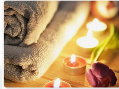
10. Thermal baths