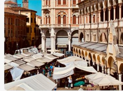
6. Historic markets