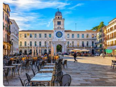
4. Strategic location