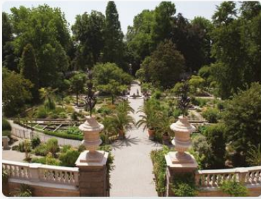
2. The Botanical Garden