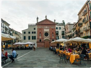
8. A gelato or a spritz?