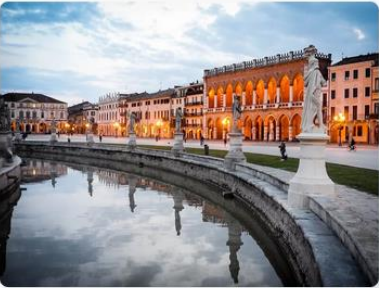
7. The city of the “three withouts”