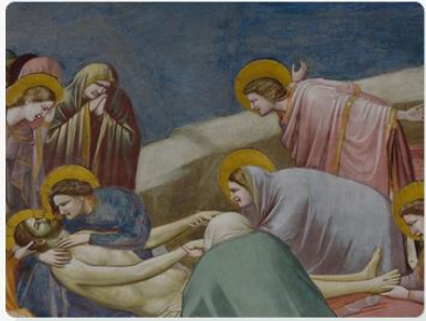
1. Enjoy the genius of Giotto